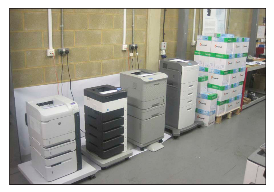
The test devices set up in BLI's Wokingham test laboratory.

VS. HP, Lexmark, Samsung 500,000 impression study